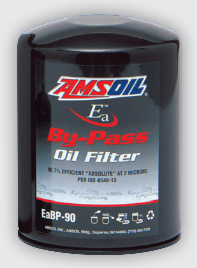
EaBP90 • EaBP100 • EaBP110 • EaBP120

AMSOIL Ea Bypass Oil Filters provide maximum filtration protection against wear and oil contamination. Working in conjunction with the engine's full-flow oil filter, AMSOIL Ea Bypass Filters operate by filtering oil on a "partial-flow" basis. They draw approximately 10 percent of the oil sump's capacity at any one time and trap the extremely small, wear-causing contaminants that full-flow filters can't remove. AMSOIL Ea Bypass Filters typically filter all of the oil in the system several times an hour, so the engine continuously receives analytically clean oil.