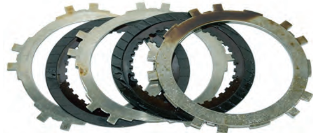
Automatic transmission clutch plates after cleanup with AMSOIL Engine and Transmission Flush reveal lighter glazing and varnish.